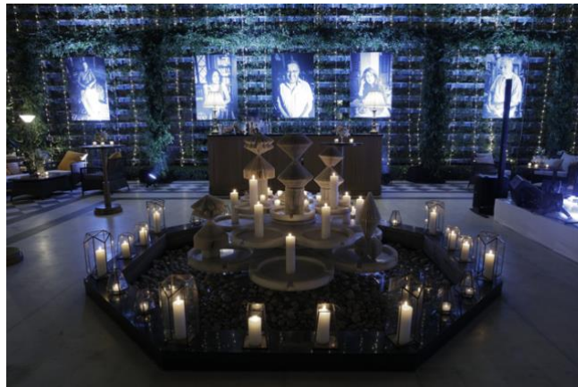
Portraits of the shortlisted authors by Sooni Taraporevala for VogueIndia