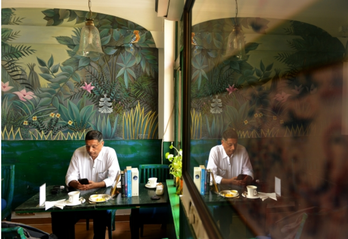
Traversing through Shillong, Delhi and Udupi, Reading Spaces attempts to explore the intimate and interactive relationship between readers and their environments. Featured in this image is economist Arvind Subramaniam in a cafe at Khan Market in New Delhi.